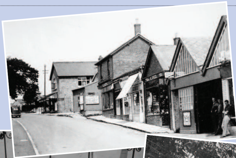
Bovington in the 1930s, the Red Garage right foreground.