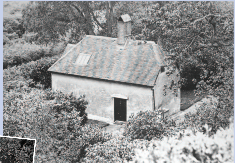
Above: Clouds Hill, prior to the rendering and whitewashing of its walls, a tiled roof having replaced the original thatch.