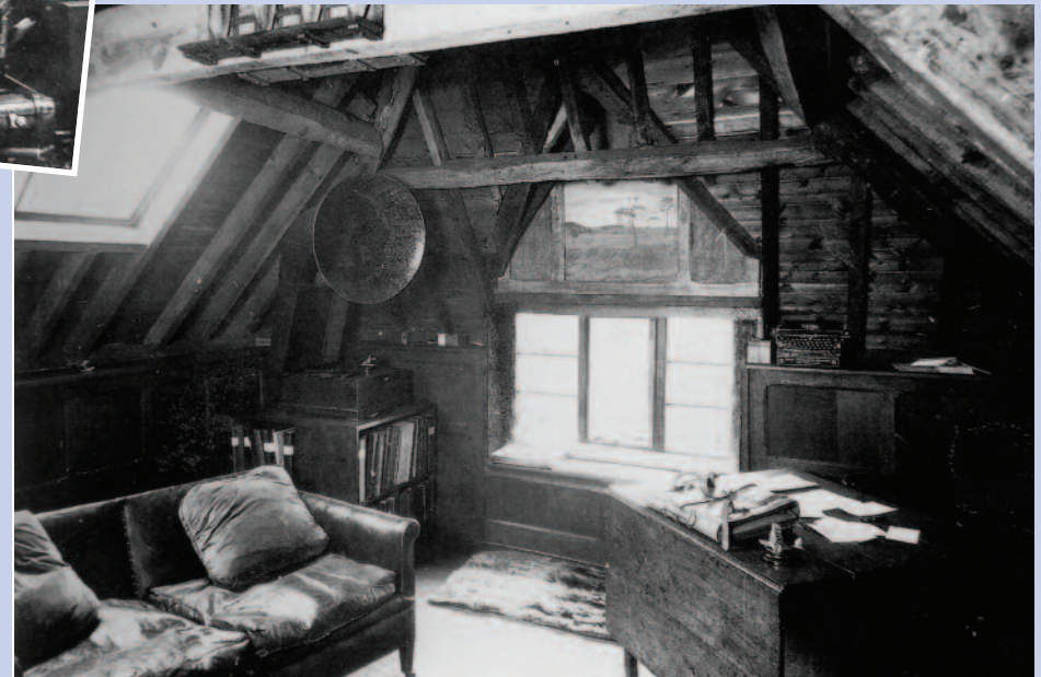
Below: Clouds Hill, the Music Room, 1935.